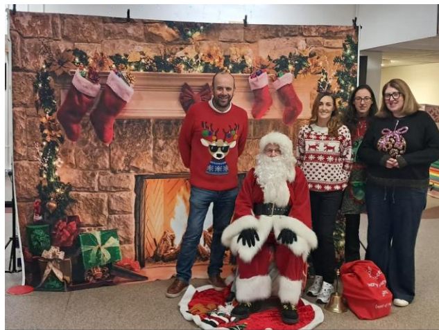
Some of the members of our Parents Association with Santa.