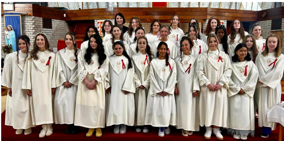
It was a gorgeous day with sun shine and hymns performed beautifully by 5 th class pupils.